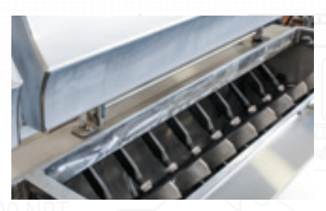
The counter weighted access doors allow quick access and are operator friendly.