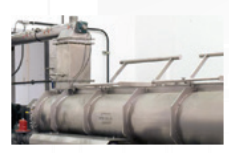
The AVT system for steam & fines suppression from Dual Cylinder, no venting of dust or steam to atmosphere.