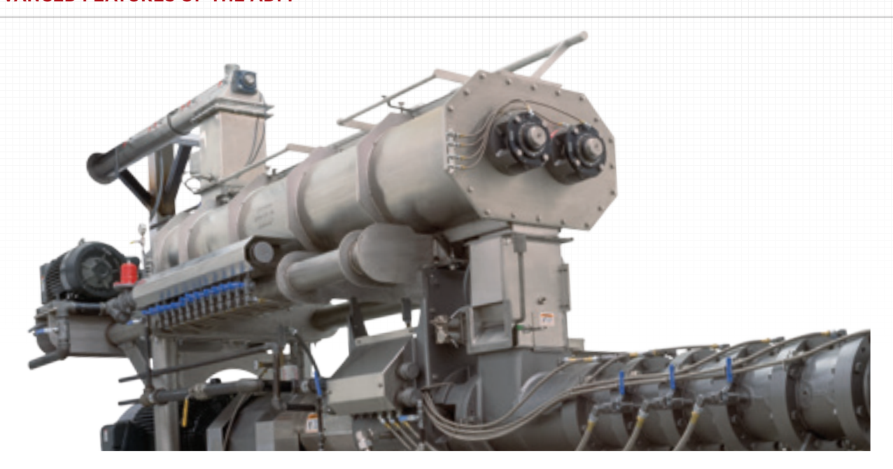
ADP Meat Inclusion Guide